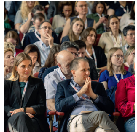
Designed and Produced by ProCreative