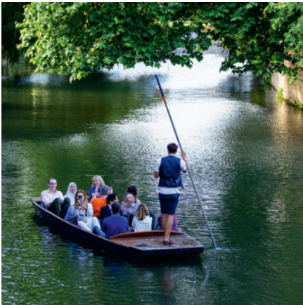
Punting on the River Cam, St John's College

You will have time to network in this conference with its idyllic ambiance where you will enjoy the charming summer school atmosphere.