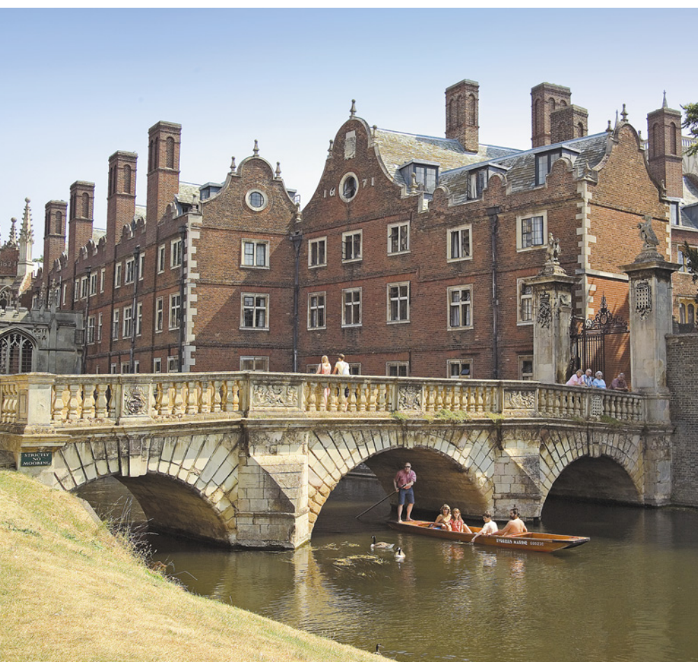
The Wren Bridge, St. John's College

GET MORE INFORMATION AND REGISTER www.privacylaws.com/ac30