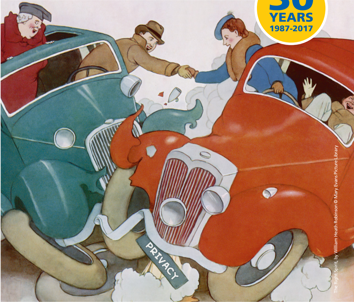
The Right Spirit, by William Heath Robinson

“An interesting and broad range of speakers and topics. It provided enough time to network and the venue is amazing.”