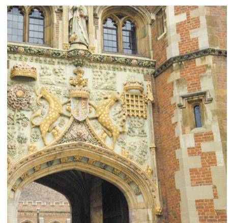
Second Court Entrance, St. John's College